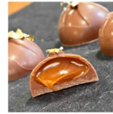
Toffee d'or caramel